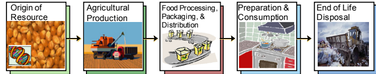
The Food System Life Cycle

Americans enjoy a diverse abundance of cheap food – spending a mere 9.9% of our disposable income on food. 1 However, store prices do not reveal the external costs – economic, social, and environmental – that impact the sustainability of the food system. Considering the full life cycle of the U.S. food system (graphic right) illuminates the connection between consumption behaviors and production practices.